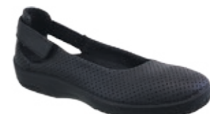
L58 Black $149.95