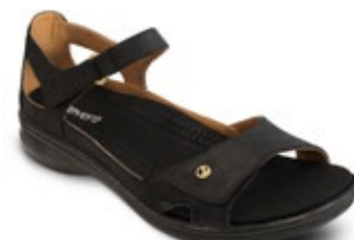
PORTOFINO Onyx $179.95