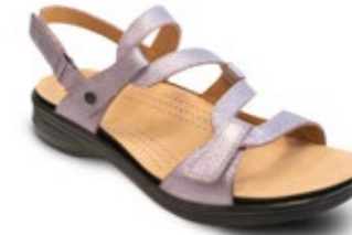
MIAMI Lilac $169.95