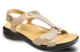
SANTA MONICA Champagne $169.95