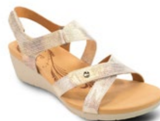
Casablanca Metallic Interest $179.95