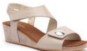
KYLIE POLKA Taupe, White, Black $159.95