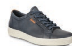
Soft 7 | $239.99 Marine - Also available in Cognac and Navajo Brown