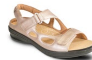
ASTORIA Champagne $189.95 Also available in Navy Snake