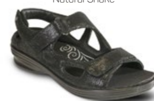
ASTORIA Black Lizard $189.95