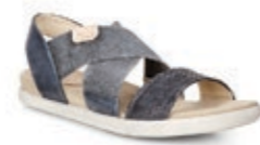
Damara Sandal | $169.95 Black