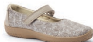
L45 D48 Bergonia Taupe, $169.95