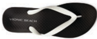
MEN'S MANLY Black/White $39.95