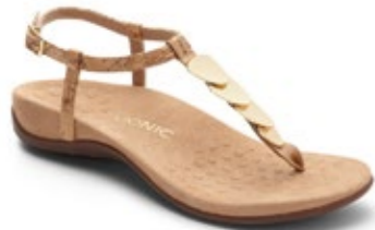
Miami Gold Cork $149.95