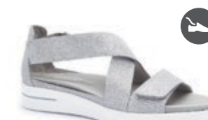
PEARLE Grey Pebble $199.95