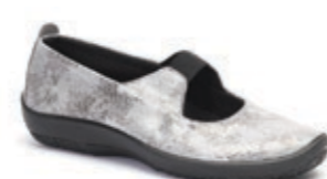
LEINA CROACIA Light Grey $169.95