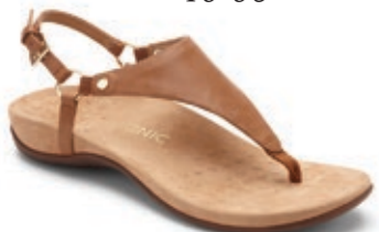
Kirra Brown $159.95