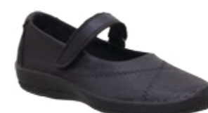
L18 Black $149.95