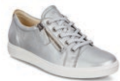
Soft 7 Zip | $239.95 Concrete Metallic