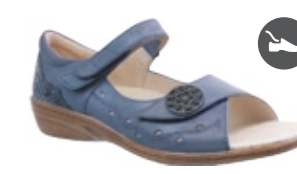
VENICE Light Taupe, Denim, Black $199.95