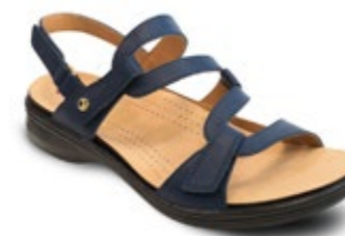
MIAMI Blue French $169.95