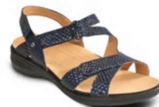
ZANZIBAR Navy Snake $169.95