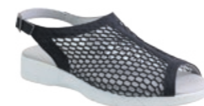
ANTALIA Black/White, $169.95