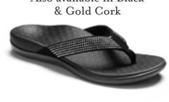
Islander Rhinestones Black $99.95