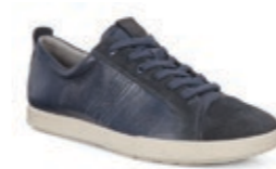
Collin 2.0 | $199.95 Navy Marine