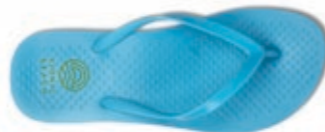
NOOSA Ocean $39.95