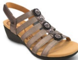
Bari Floral Gunmetal $169.95