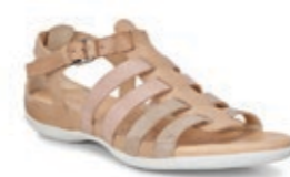
Flash | $199.95 Powder Dune