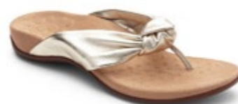
Pippa Champagne $149.95