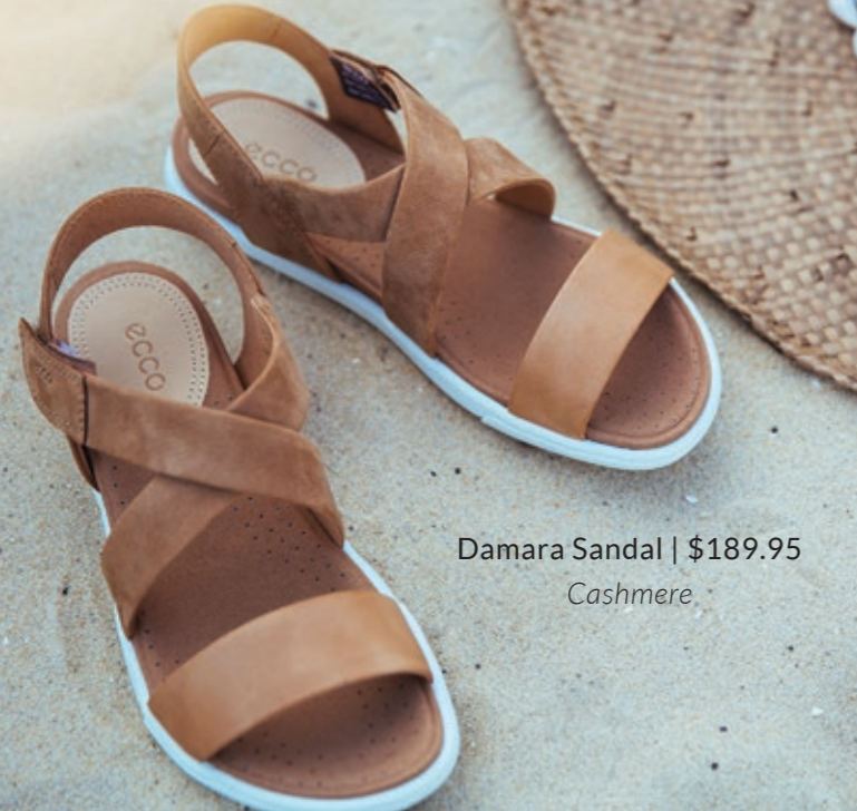
Damara Sandal | $189.95 Cashmere