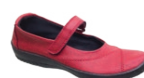
L18 Cherry $149.95