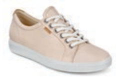
Soft 7 Lace | $239.95 Vanilla