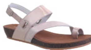
BALI Rose Gold, Black $159.95