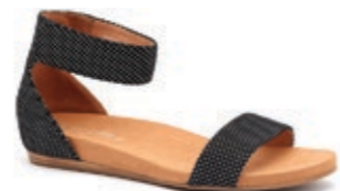
DESTINY Polka, Tan/Navy Combo $159.95