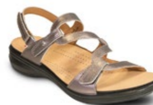
MIAMI Gunmetal $169.95 Also available in Bronze Snake