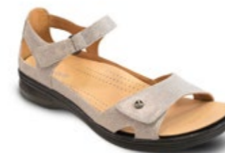
PORTOFINO Gold Wash $179.95