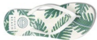
NOOSA Palm White $49.95