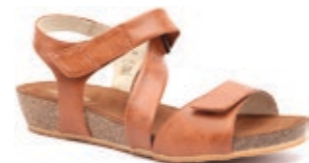
BETTY Tan, Black, Denim $159.95