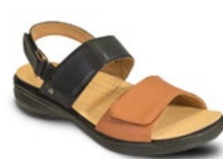
COMO Black & Tan $169.95