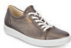
Soft 7 Lace | $239.95 Black Stone Metallic