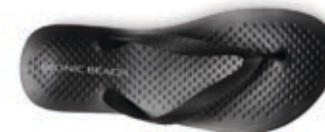
MEN'S MANLY Black $39.95