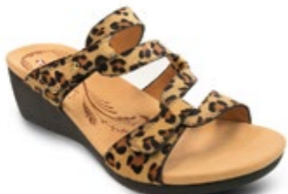
SOFIA Leopard $159.95