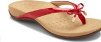
Bella Red Patent $109.95