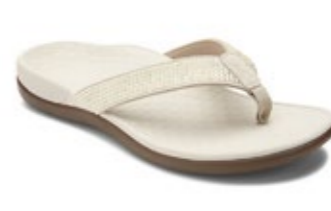
Islander Rhinestones Champagne $99.95