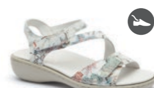
ABBEY White Pebble, Metallic $199.95