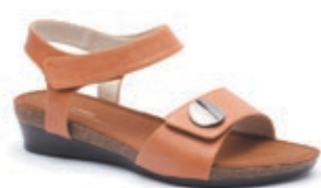
HAPPY Multi Pebble, Pewter, White, Tan $159.95