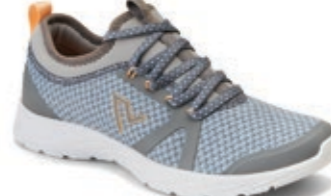
Alma Grey/Blue $169.95