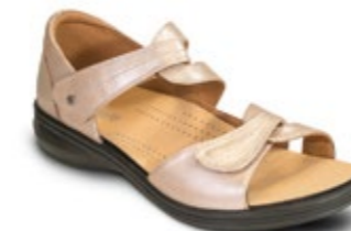
GENEVA Champagne $179.95