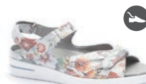
PRECIOUS White Pebble, Black Metallic $199.95