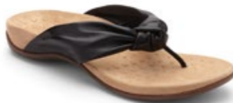
Pippa Black $149.95