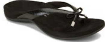
Bella Black Lizard $109.95 Also available in Black & Gold Cork