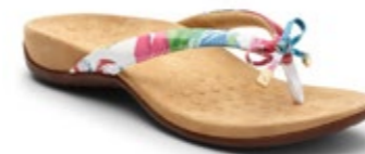
Bella White Floral $109.95