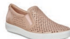
Soft 7 | $239.95 Champagne