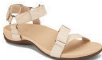
Candace Nude $149.95