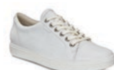
Soft 7 Lace | $239.95 White