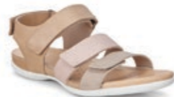
Flash Dune | $179.95 Rose