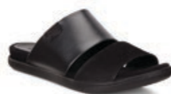
Damara | $189.95 Sandal Black