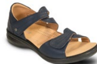
GENEVA Navy $179.95