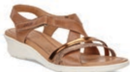
Felicia Sandal | $199.95 Cashmere