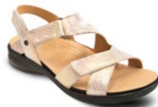
ZANZIBAR Metallic Interest $169.95