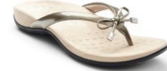
Bella Pewter $109.95