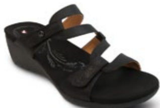
SOFIA Onyx $159.95