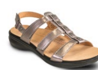
TOLEDO Gunmetal $169.95