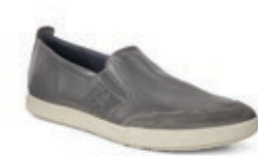
Collin 2.0 | $199.95 Magnet