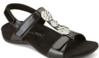
Farra Black Lizard $139.95