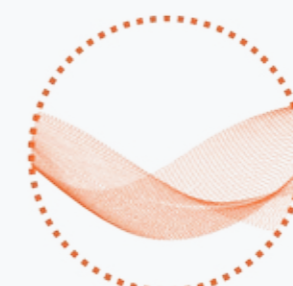
TECHNO ELASTIC UPPER Foot adjustable