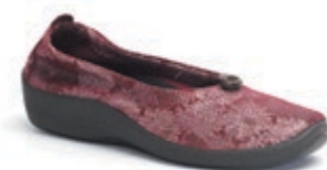
L14 CROACIA Bordeaux, Black, $139.95