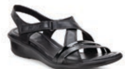
Felicia Sandal | $199.95 Black