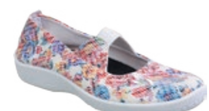
LEINA B B82 White, $169.95