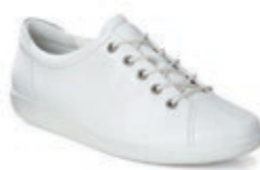
Soft 2.0 | $199.95 White Feather