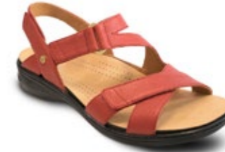
ZANZIBAR Ruby Metallic $169.95