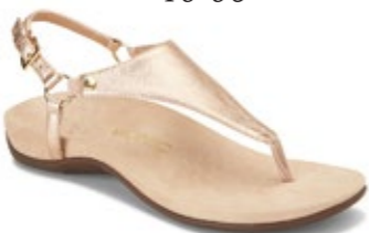
Kirra Rose Gold $159.95