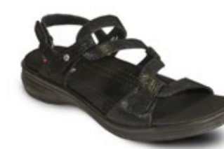
MIAMI Black Lizard $169.95 Also available in Black & Red Croc