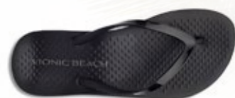
NOOSA Black/Black $39.95

Our iconic Beach thong supports your sole and take you places where your mind and body want to go.