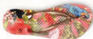
NOOSA Red Tropical Bronze $49.95