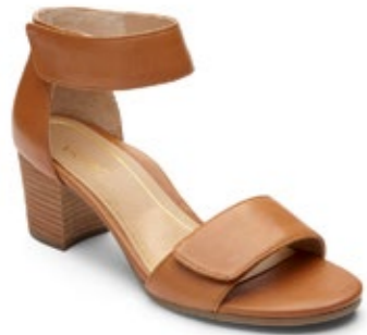
Solana Saddle $239.95