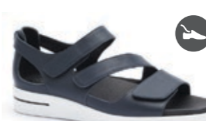
PATIENCE Navy $199.95