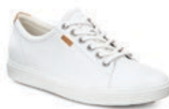
Soft 7 lace | $239.95 White