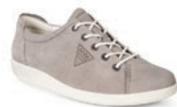
Soft 2.0 | $199.95 Warm Grey