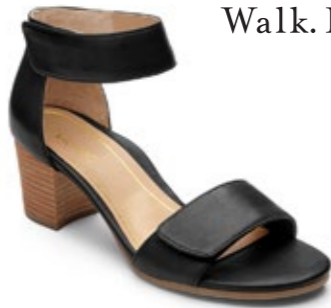
Solana Black $239.95