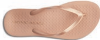
NOOSA Rose Gold $39.95