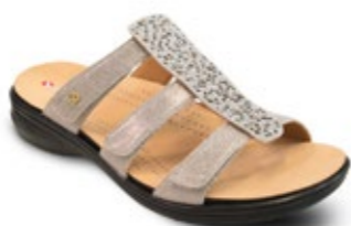
CATALINA Gold Wash $169.95