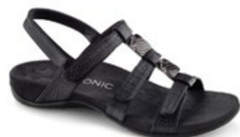
Amber Black Croc $129.95