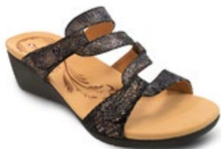
SOFIA Black Metallic Python $159.95