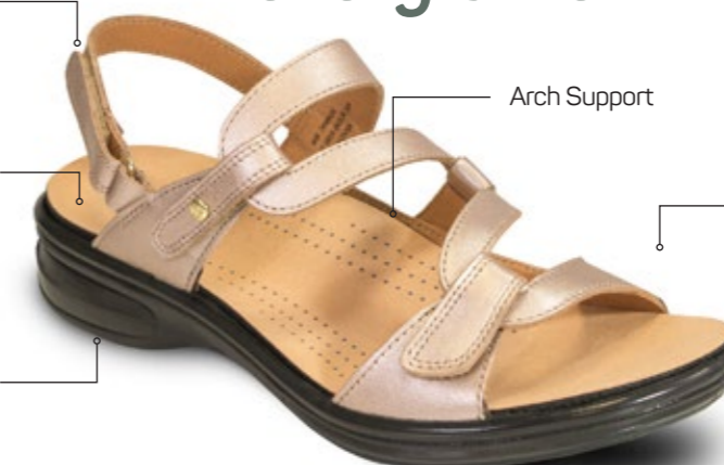
Miami Champagne $169.95