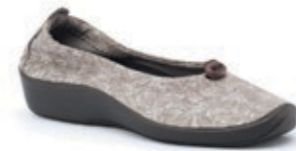
L14 D48 Bergonia Taupe, $139.95