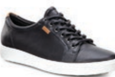
Soft 7 Lace | $239.95 Black