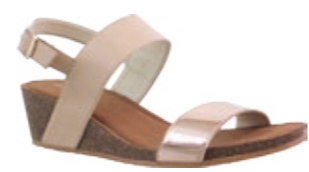
KATHRYN Nude/Rose Gold, Navy/Tan Combo $159.95