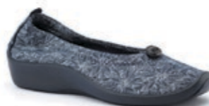
L14 D49 Bergonia Navy, $139.95