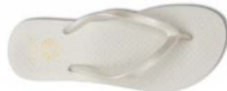
NOOSA Pearl White $39.95