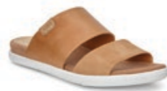
Damara | $189.95 Sandal Cashmere