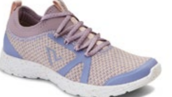
Alma Purple Multi $169.95