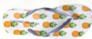
NOOSA Silver Pineapple $49.95