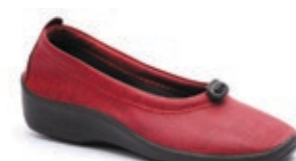
L1 Cherry, Bronze, Black $119.95