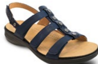
TOLEDO Navy/Blue Snake $169.95