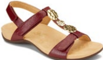
Farra Fig Lizard $139.95