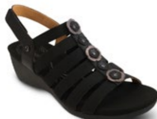
Bari Floral Black French $169.95