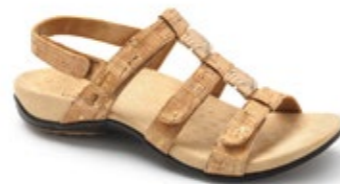
Amber Gold Cork $129.95