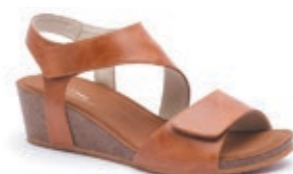
KYRA Burnished Tan, Black Print $159.95