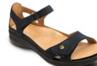
PORTOFINO Navy Lizard $179.95