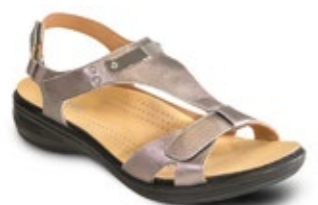
SANTA MONICA Gunmetal $169.95