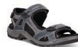
Offroad | $199.95 Marine