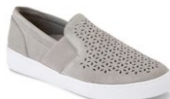
Kani Light Grey $199.95