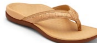
Islander Gold Cork $79.95 Also available in Pewter, Mauve and Black