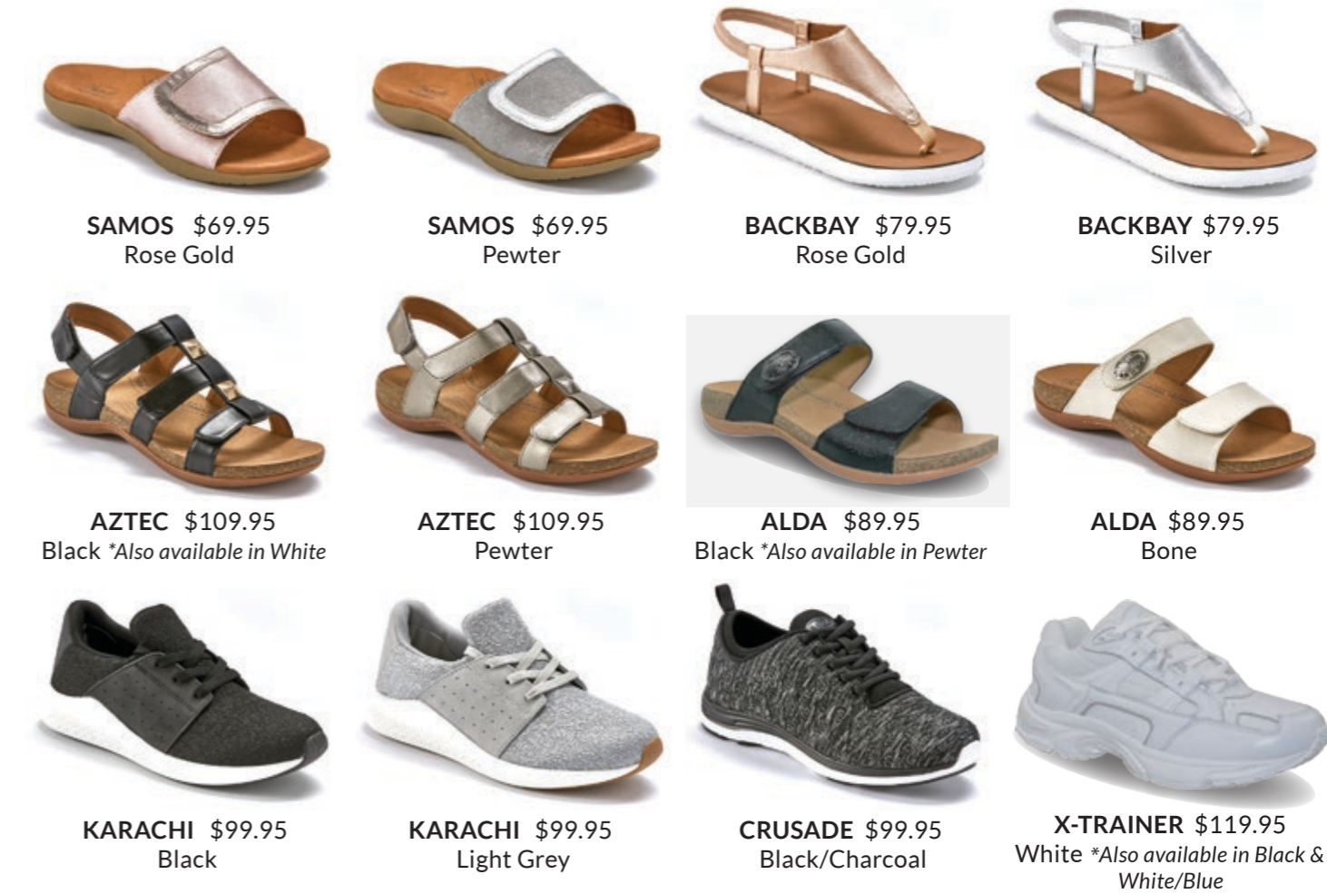
SAMOS $69.95 Rose Gold SAMOS $69.95 Pewter BACKBAY $79.95 Rose Gold BACKBAY $79.95 Silver AZTEC $109.95 Black *Also available in White AZTEC $109.95 Pewter ALDA $89.95 Black *Also available in Pewter ALDA $89.95 Bone KARACHI $99.95 Black KARACHI $99.95 Light Grey CRUSADE $99.95 Black/Charcoal X-TRAINER $119.95 White *Also available in Black & White/Blue