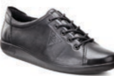
Soft 2.0 | $199.95 Black