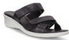
Felicia Sandal | $199.95 Black sambal also available in Powder