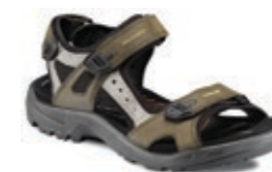
Offroad | $199.95 Tarmac