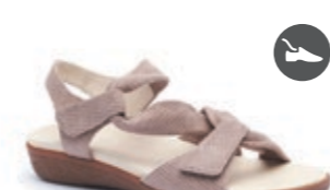
LISETTE II Taupe Polka, Black Polka $199.95