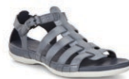
Flash | $199.95 Sambal Marine