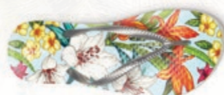
NOOSA Lt Blue Floral Silver $49.95