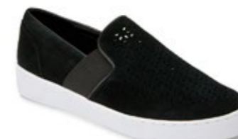
Kani Black $199.95 Also available in Rose