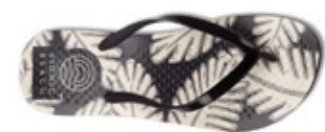
NOOSA Palm Black $49.95