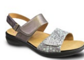
COMO Teal/Gunmetal $169.95 Also available in Gunmetal/ Natural Snake