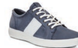
Soft 7 | $239.99 Marine White