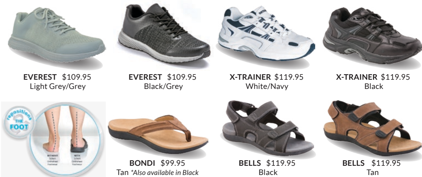
EVEREST $109.95 Light Grey/Grey EVEREST $109.95 Black/Grey X-TRAINER $119.95 White/Navy X-TRAINER $119.95 Black BOND $99.95 Tan *Also available in Black BELLS $119.95 Black BELLS $119.95 Tan