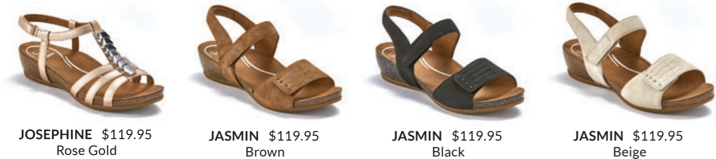
JOSEPHINE $119.95 Rose Gold JASMIN $119.95 Brown JASMIN $119.95 Black JASMIN $119.95 Beige

JOSEPHINE $119.95 Black - Incredibly light weight - Stylish cork wedge incorporating Podiatrist designed Orthaheel technology - Rubber outsole providing slip resistance & durability