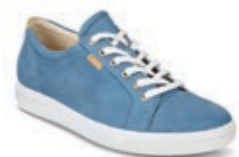
Soft 7 Lace | $239.95 Retro Blue