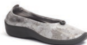
L14 CROACIA Grey, $139.95