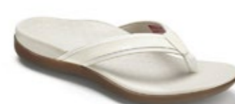
Islander White $79.95