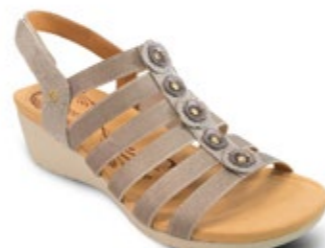
Bari Floral Gold Wash $169.95