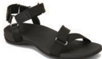
Candace Black $149.95