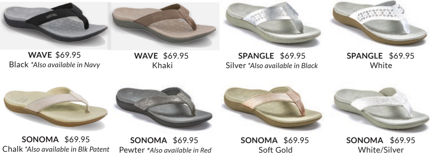
WAVE $69.95 Black *Also available in Navy WAVE $69.95 Khaki SPANGLE $69.95 Silver *Also available in Black SPANGLE $69.95 White SONOMA $69.95 Chalk *Also available in Blk Patent SONOMA $69.95 Pewter *Also available in Red SONOMA $69.95 Soft Gold SONOMA $69.95 White/Silver

$69.95 FOR ONE PAIR OR $120 FOR TWO PAIRS