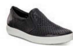
Soft 7 | $239.95 Black