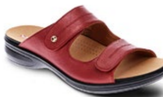
FLORENCE Ruby Metallic $159.95