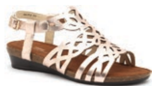
HARLEY Rose Gold, Black, Tan $159.95