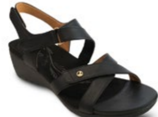
Casablanca Black French $179.95