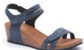
KIMBERLEY Jeans Blue, Black Sparkle, Taupe Print, Navy Print $159.95