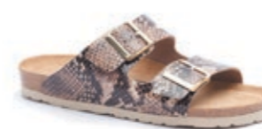
HAWAII PRINT Snake Brown, Galaxy Silver $109.95