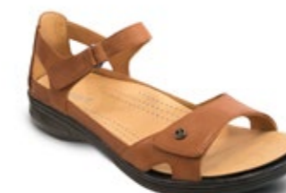
PORTOFINO Cognac $179.95