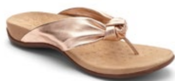
Pippa Rose Gold $149.95