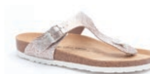
ROSAS PRINT Aspide Silver $109.95