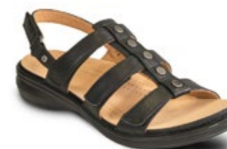
TOLEDO Black $169.95