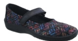
L45 B08 Black, $169.95