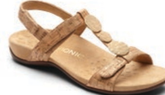
Farra Gold Cork $139.95