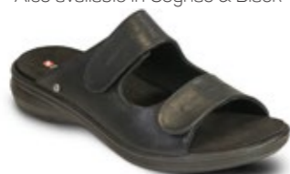
FLORENCE Black $159.95