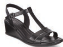
Shape 35 Wedge Sandal | $229.95 Black