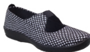
LEINA Black/White Diamond $169.95