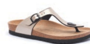
ROSAS Bronze, Black, Red, Silver, White $99.95