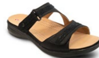
RIO Onyx/Black Lizard $159.95