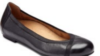
Caroll Black $189.95