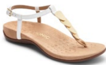
Miami White $149.95