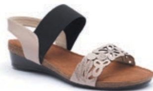
HARMONY Taupe, Denim, Living Coral $159.95