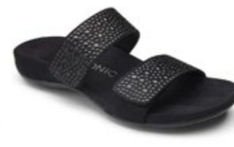
Samoa Black $139.95