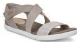
Damara Sandal | $189.95 Moon