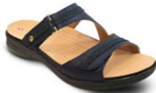
RIO Sapphire/Navy Lizard $159.95