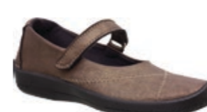
L18 Bronze $149.95