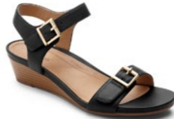
Frances Black $199.95