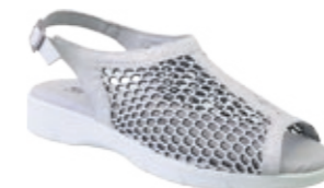
ANTALIA White/Silver, $169.95