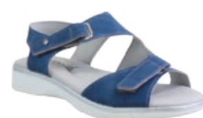
SCREAM Blue $169.95