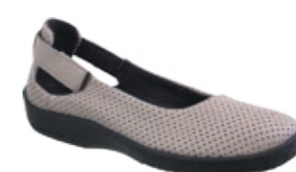
L58 Taupe $149.95