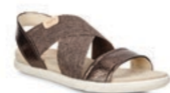
Damara Sandal | $169.95 Licorice