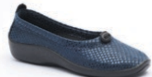
L14 Navy Diamond, Black/White Diamond, Black Snake, $139.95