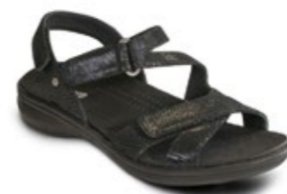
ZANZIBAR Black Lizard $169.95