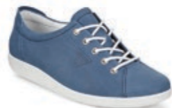
Soft 2.0 | $199.95 True Navy