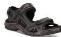
Offroad | $199.95 Black