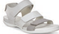
Flash | $179.95 WildDove