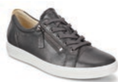
Soft 7 ZIP | $239.95 Black Metallic