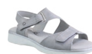
SCREAM Grey $169.95