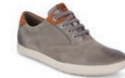
Collin 2.0 | $239.95 WarmGrey