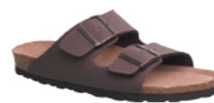
HAWAII Mokka, Black, White $99.95