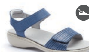
ARIEL II Denim, Black $199.95