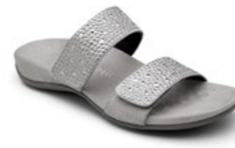
Samoa Pewter $139.95