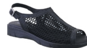
ANTALIA P Black, $169.95

BUY 2 PAIRS OF ARCOPEDICO® RECEIVE 20% OFF