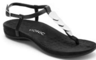
Miami Black $149.95