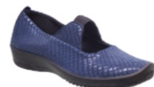
LEINA Navy Diamond, Black Diamond, $169.95