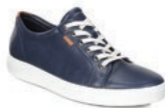
Soft 7 Lace | $239.95 Marine