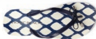
BELLS White/Navy $49.95 Also available in Grey/Silver