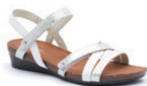
HEATHER White Combo, Black Combo, Rose Gold $159.95