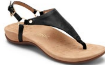
Kirra Black $159.95