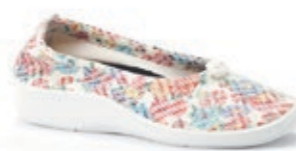
L14 B B82 White, $139.95