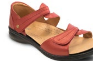
GENEVA Ruby Metallic $179.95 Also available in Black & Black Lizard