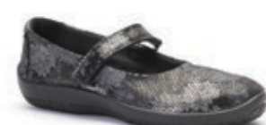
L45 CROACIA Light Grey, Bordeaux, Black $169.95