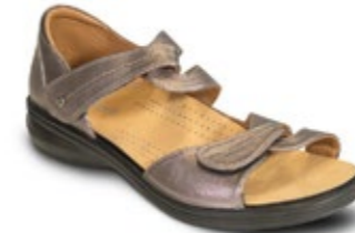
GENEVA Gunmetal $179.95