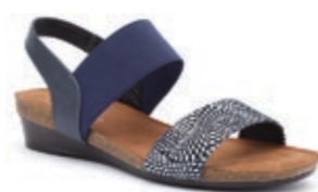
HANNAH Navy Print, Taupe Print, Black Print $159.95