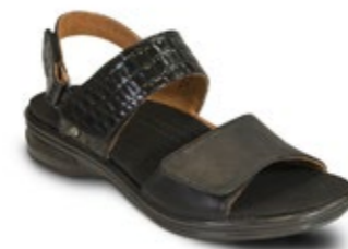
COMO Black Croc $169.95