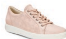
Soft 7 Lace | $239.95 Rose Dust