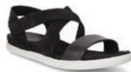
Damara Sandal | $189.95 Black