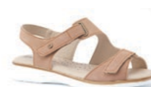
SCREAM Tan $169.95