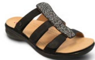
CATALINA Onyx $169.95